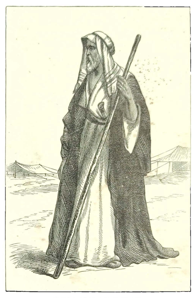
AN ARAB SHEIKH LEANING ON HIS STAFF.