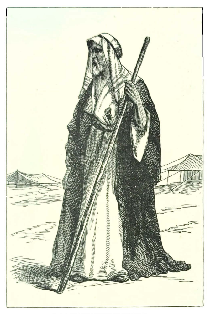
AN ARAB SHEIKH LEANING ON HIS STAFF.